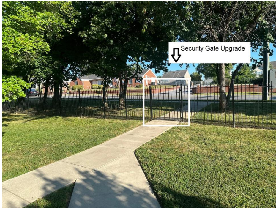
Figure 2- Opening ~4'4"w, current gate ~4'2"w. Height 5ft.