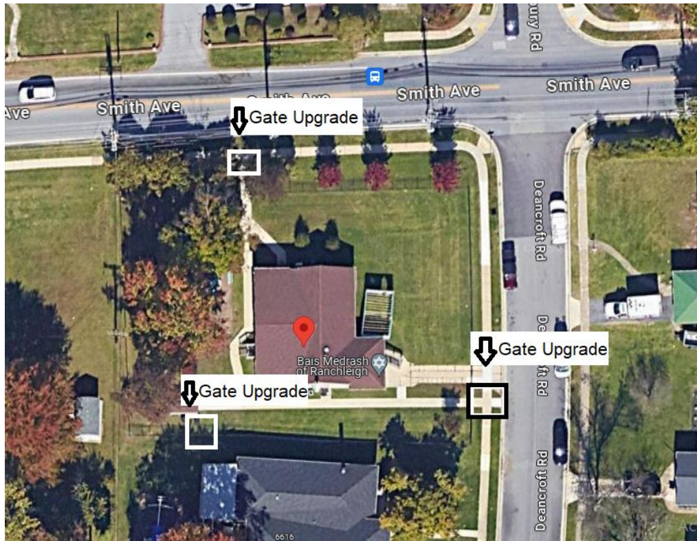
Figure 1- Aerial view of property with marked gate locations.

Any damage done to the Bais Medrash of Ranchleigh property or its visitors during the job shall be repaired to pre-construction condition without cost to Bais Medrash of Ranchleigh or its visitors.