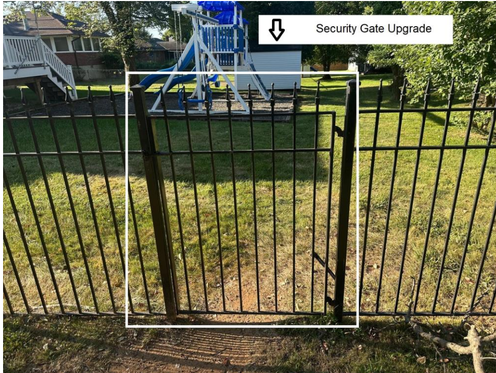
Figure 4- Opening ~3'4", current gate ~ 3'1.5". Height 5ft.

1.4 Period of Performance (PoP): To be proposed by contractor. The PoP will be based on a detailed schedule submitted by the contractor, that includes major milestones prior to the start of work.